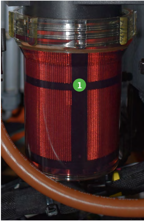
1 NEW: Enhanced Fuel Filtration that supports common-rail fuel injection.