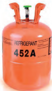
X 4 Series