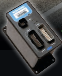
Main Micro Module