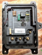
Power Control Module